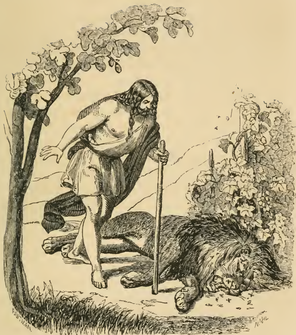
SAMSON FINDING HONEY.

“ And on his way as he passed the vineyard where he had killed the lion, he turns aside to see the carcass, and behold it was full of bees and honey.” Page 170.